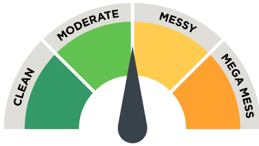
The Messy Meter